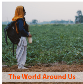
The World Around Us