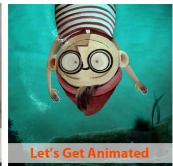
Let's Get Animated